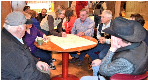
Source to Tap meeting in Springpoint Hall

The OWC and Water Matters have just wrapped up Phase 2 of the Source To Tap community conversations in 8 communities in or adjacent to the Oldman headwaters area.