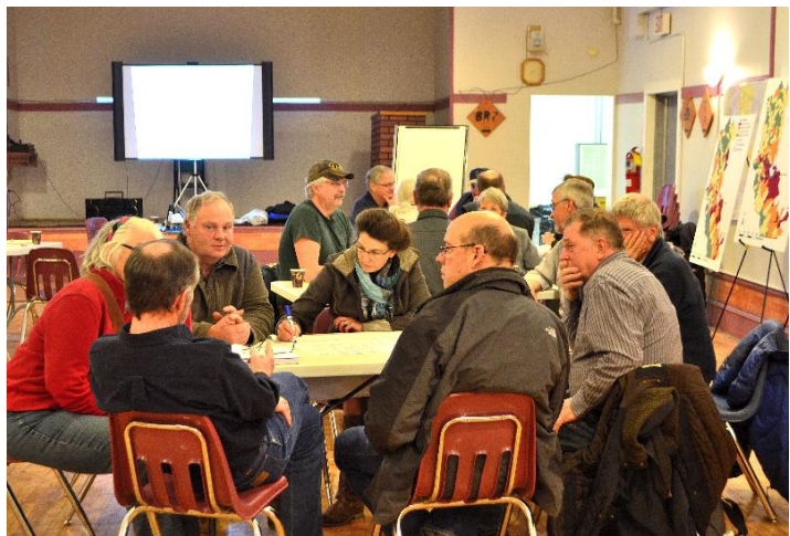
Source to Tap meeting in Lundbreck Hall

The Final Report for the Source To Tap project is currently being written and will be available soon.